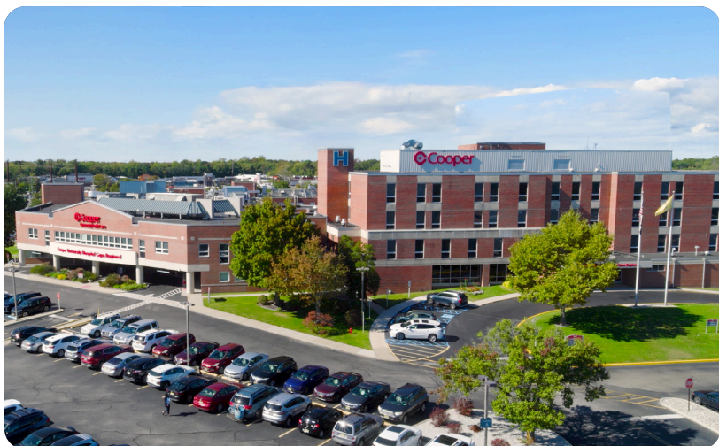
Cooper University Hospital Cape Regional