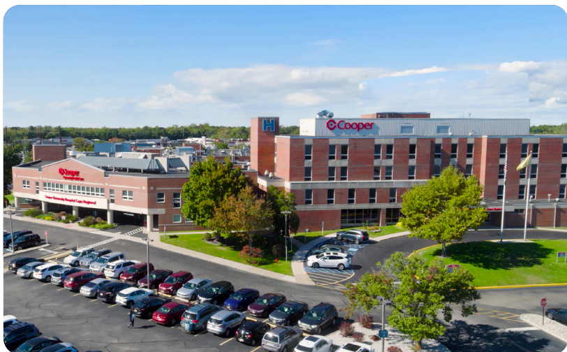
Cooper University Hospital Cape Regional